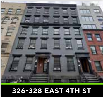
326-328 EAST 4TH ST