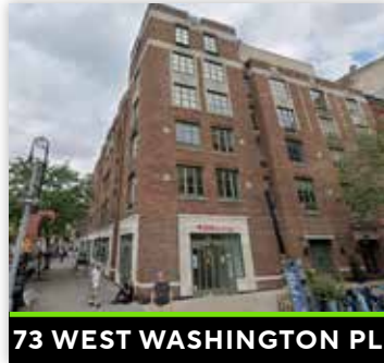
73 WEST WASHINGTON PL