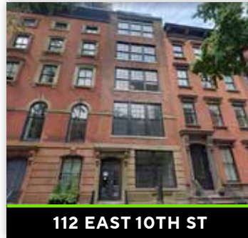
112 EAST 10TH ST