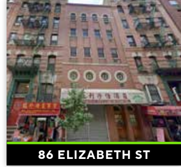
86 ELIZABETH ST