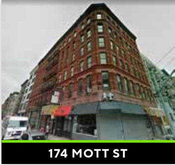
174 MOTT ST