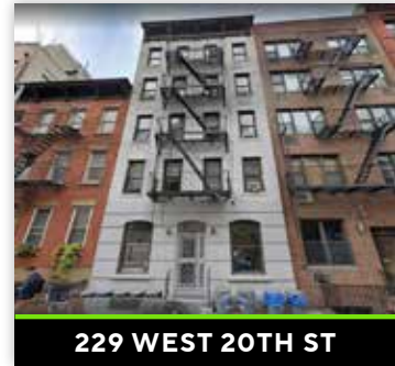
229 WEST 20TH ST