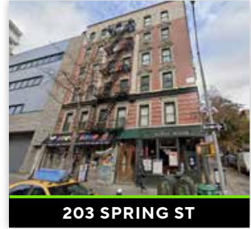
203 SPRING ST