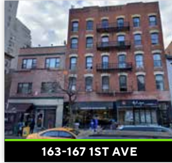
163-167 1ST AVE