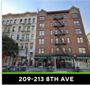
209-213 8TH AVE