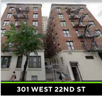
301 WEST 22ND ST