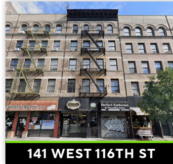
141 WEST 116TH ST