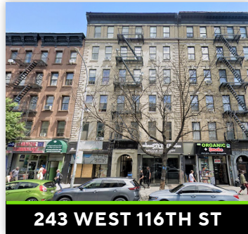
243 WEST 116TH ST