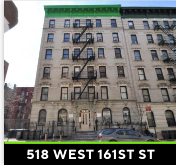
518 WEST 161ST ST