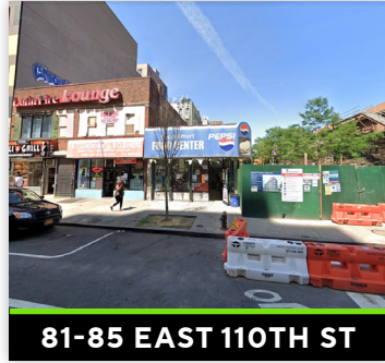
81-85 EAST 110TH ST