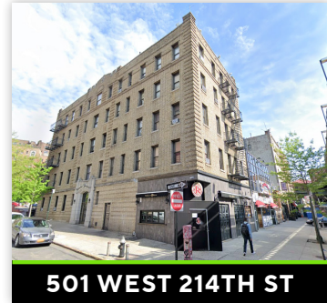
501 WEST 214TH ST