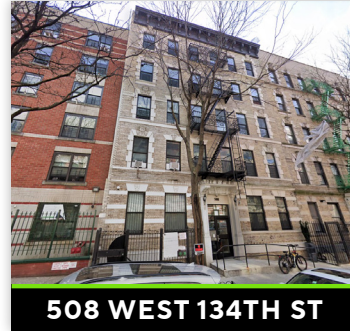
508 WEST 134TH ST