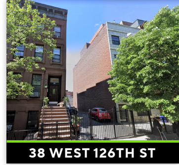
38 WEST 126TH ST