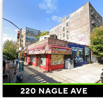
220 NAGLE AVE