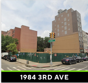
1984 3RD AVE