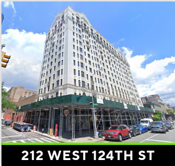
212 WEST 124TH ST