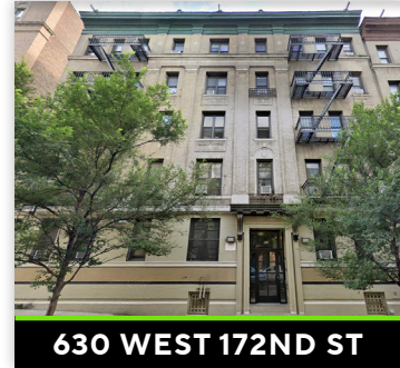
630 WEST 172ND ST