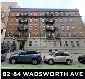
82-84 WADSWORTH AVE