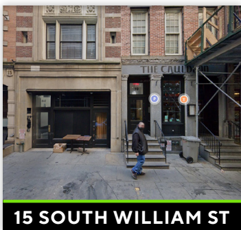
15 SOUTH WILLIAM ST