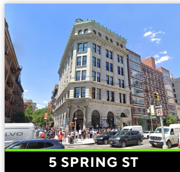
5 SPRING ST