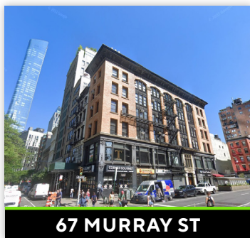
67 MURRAY ST