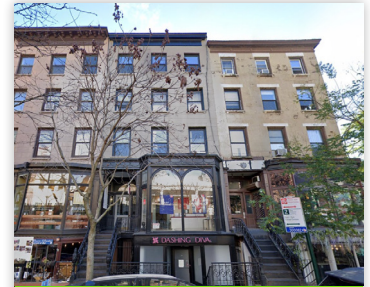
132 MONTAGUE ST