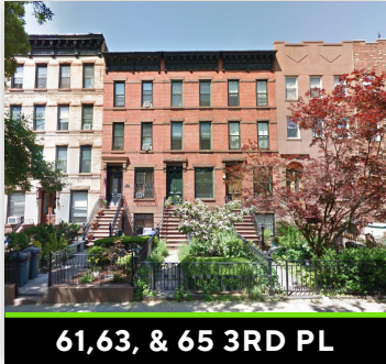
61,63, & 65 3RD PL