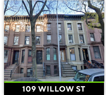
109 WILLOW ST