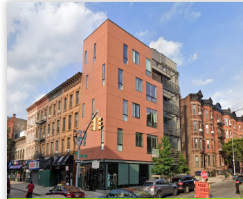
131 5TH AVE