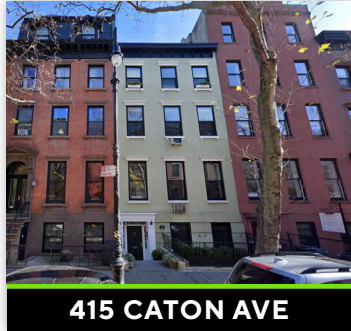
415 CATON AVE