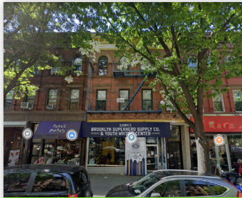
370 5TH AVE