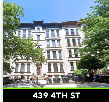
439 4TH ST