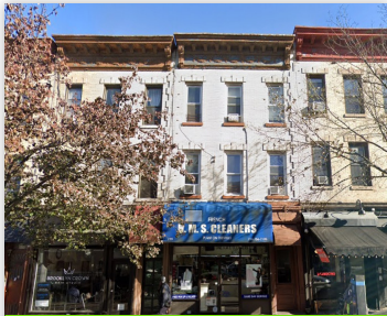
787 FRANKLIN AVE