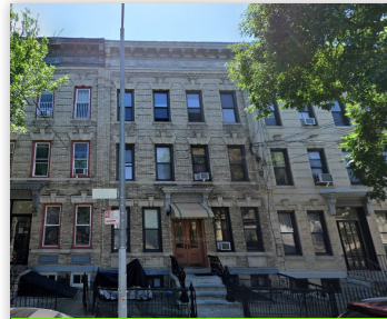
19-24 GROVE ST