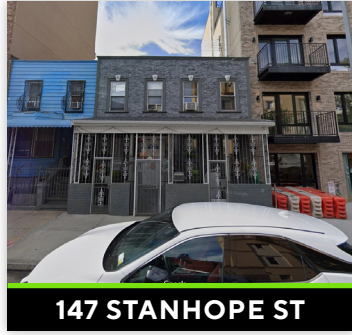
147 STANHOPE ST