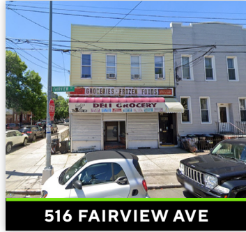
516 FAIRVIEW AVE