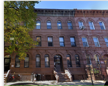
818 MARCY AVE