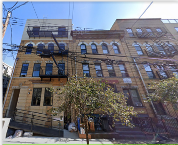
418 SUYDAM ST