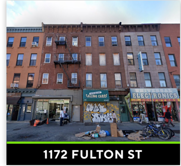
1172 FULTON ST