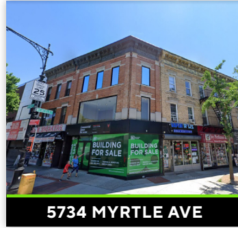
5734 MYRTLE AVE