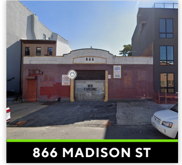
866 MADISON ST