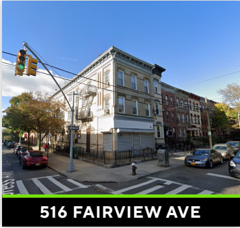
516 FAIRVIEW AVE