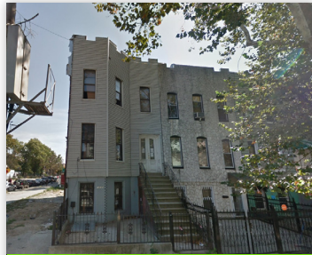
1238 HANCOCK ST