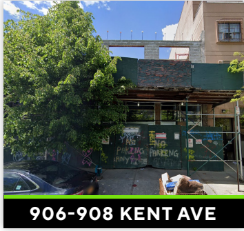
906-908 KENT AVE