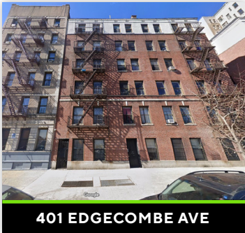
401 EDGECOMBE AVE