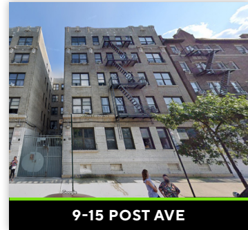
9-15 POST AVE