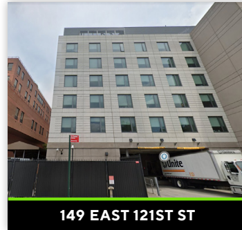
149 EAST 121ST ST