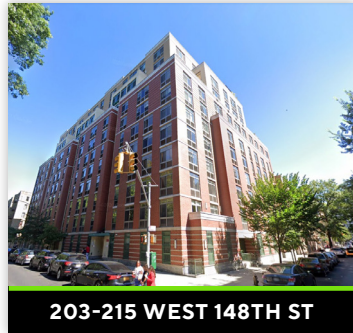
203-215 WEST 148TH ST