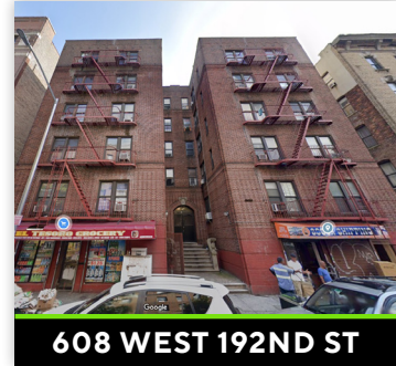
608 WEST 192ND ST