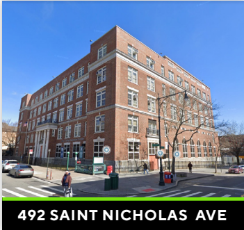
492 SAINT NICHOLAS AVE