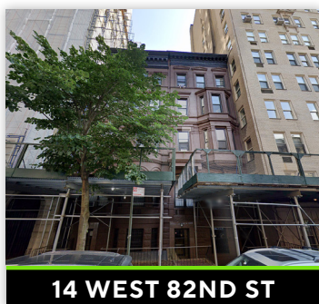
14 WEST 82ND ST