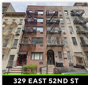
329 EAST 52ND ST