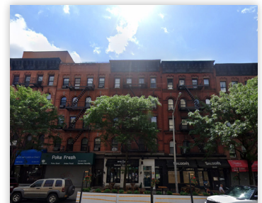
1582 YORK AVE