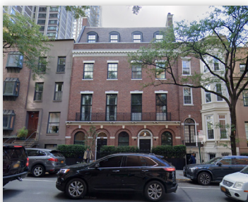
146 EAST 65TH ST