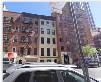
355 EAST 50TH ST