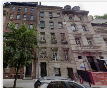
18 EAST 67TH ST