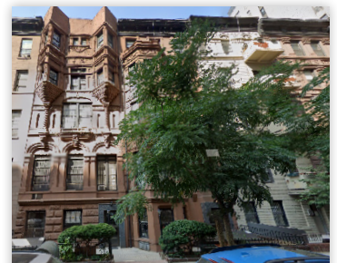
13-15 WEST 82ND ST