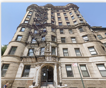
120-125 RIVERSIDE DR