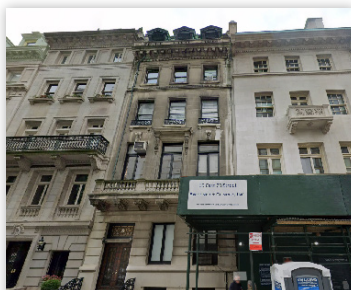
17 EAST 70TH ST