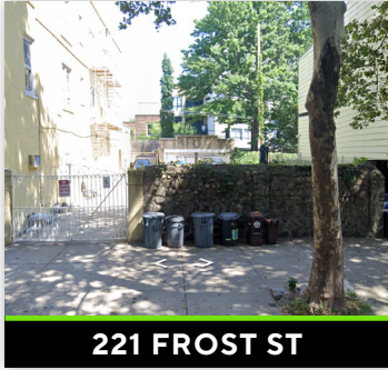
221 FROST ST