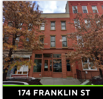
174 FRANKLIN ST