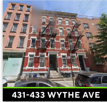
431-433 WYTHE AVE