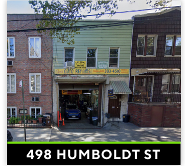
498 HUMBOLDT ST