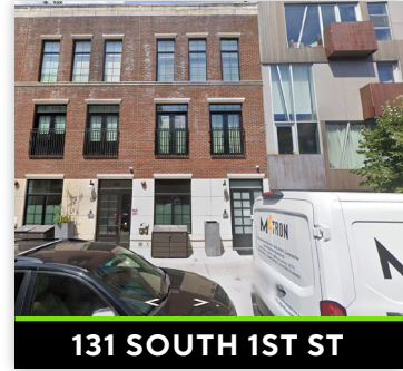
131 SOUTH 1ST ST