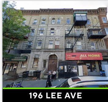
196 LEE AVE