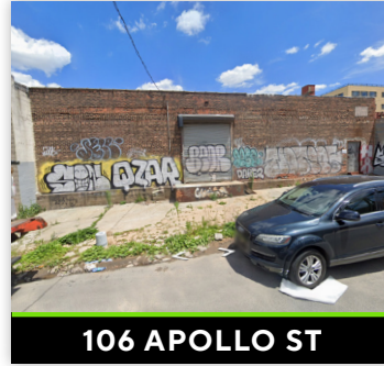
106 APOLLO ST