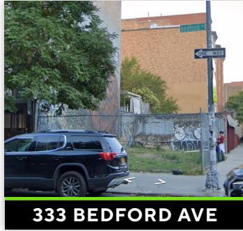
333 BEDFORD AVE