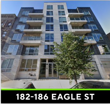
182-186 EAGLE ST