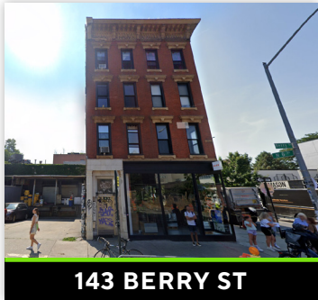
143 BERRY ST