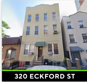
320 ECKFORD ST