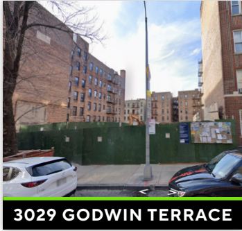
3029 GODWIN TERRACE