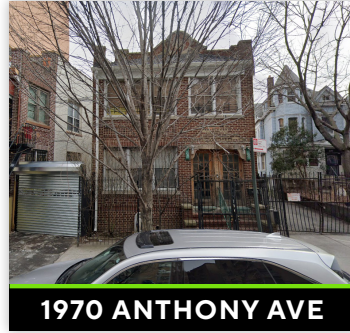
1970 ANTHONY AVE