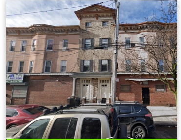
1705 TAYLOR AVE