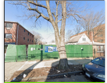
873 EAST 228TH ST