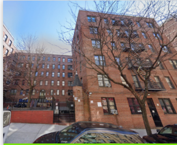
2078 MORRIS AVE