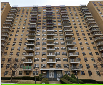
1500 NOBLE AVE