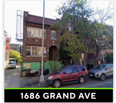
1686 GRAND AVE