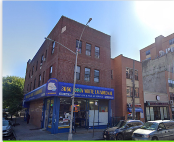
3060 3RD AVE