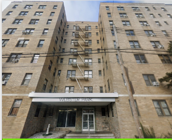
530 EAST 234TH ST