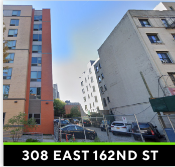
308 EAST 162ND ST