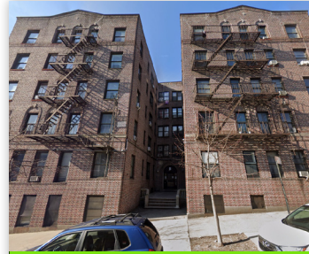
246 EAST 199TH ST