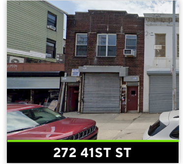
272 41ST ST