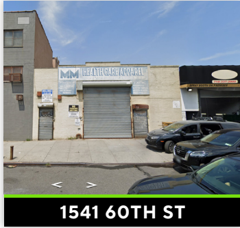
1541 60TH ST