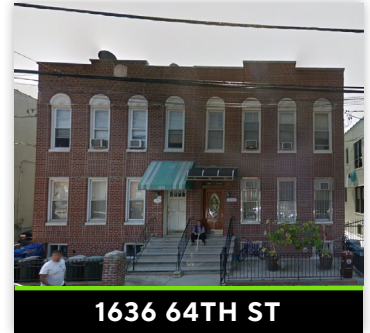
1636 64TH ST