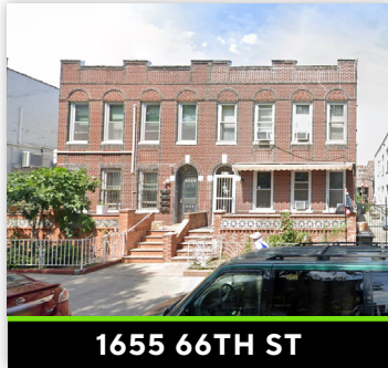
1655 66TH ST