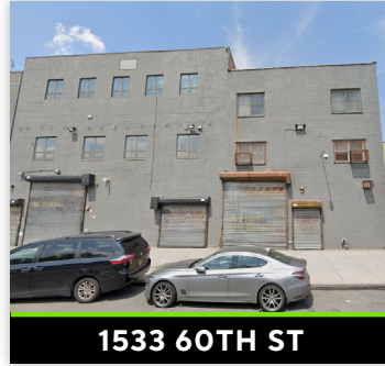
1533 60TH ST