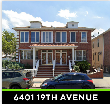
6401 19TH AVENUE