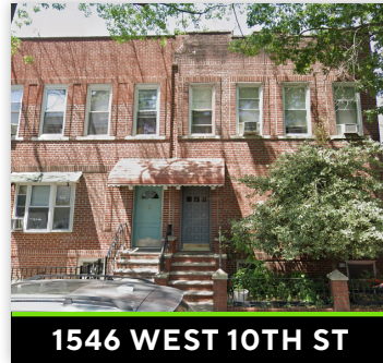
1546 WEST 10TH ST