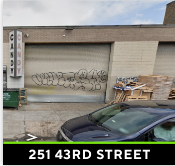
251 43RD STREET