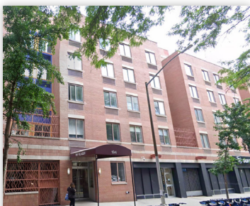
194 EAST 2ND ST