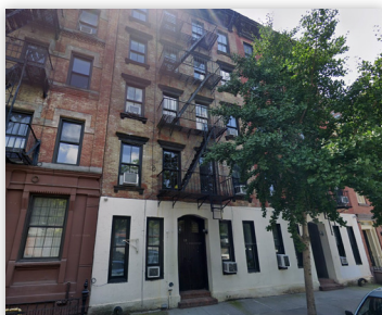
40 HORATIO ST