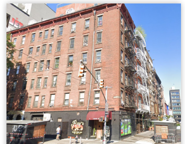
177 CHRYSTIE ST