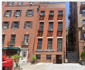
23 EAST 9TH ST