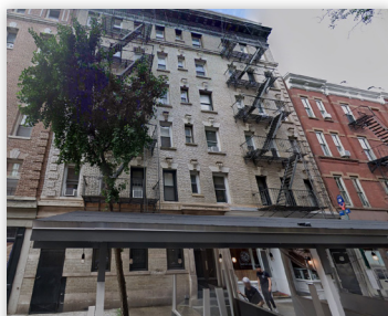
210 WEST 10TH ST