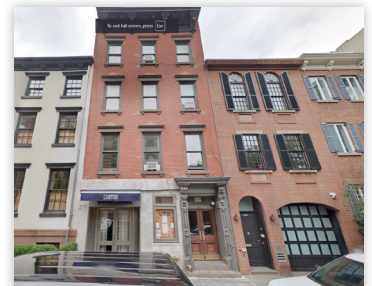
228 WEST 10TH ST