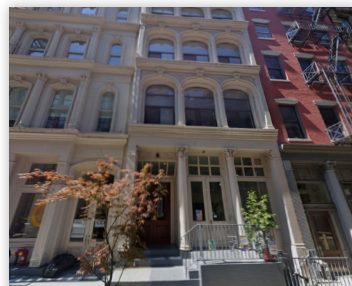
41 WHITE ST