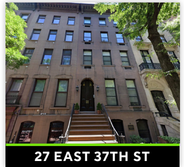
27 EAST 37TH ST