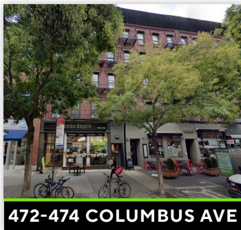
472-474 COLUMBUS AVE