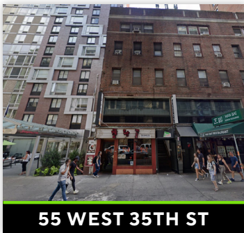
55 WEST 35TH ST