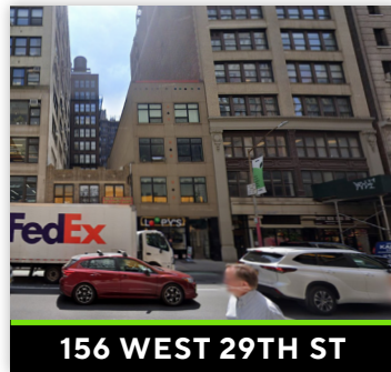
156 WEST 29TH ST