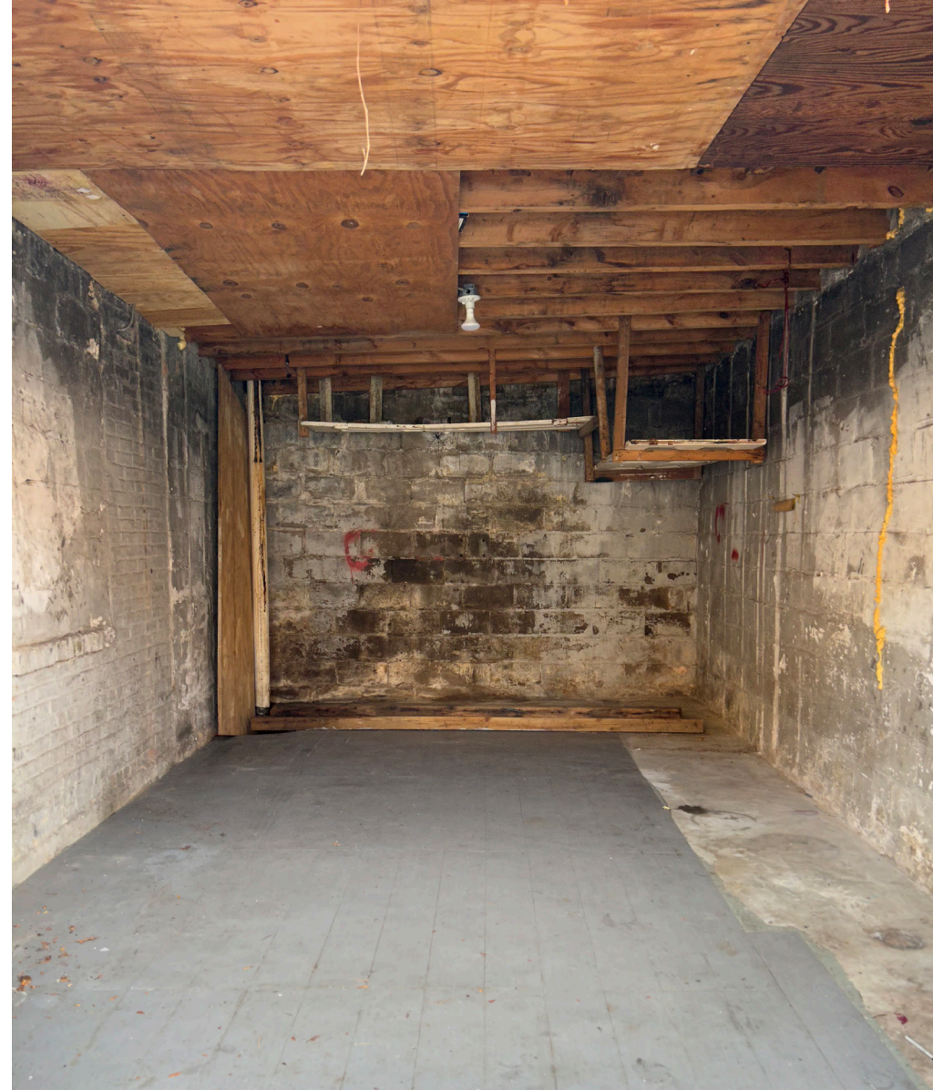
(SPACES TO BE WHITEBOXED W/ GLASS STOREFRONT + HVAC)