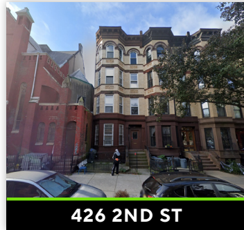
426 2ND ST