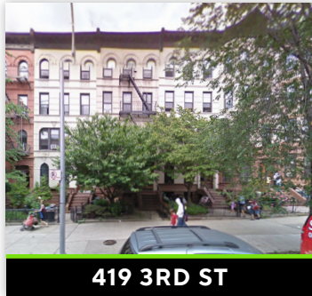
419 3RD ST