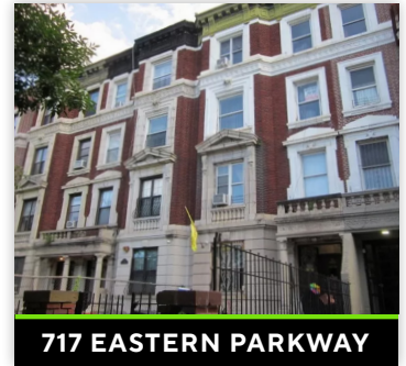
717 EASTERN PARKWAY