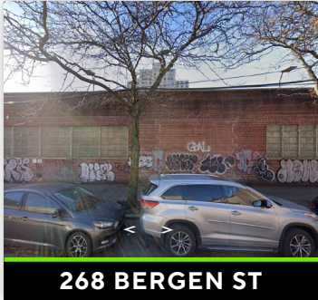
268 BERGEN ST