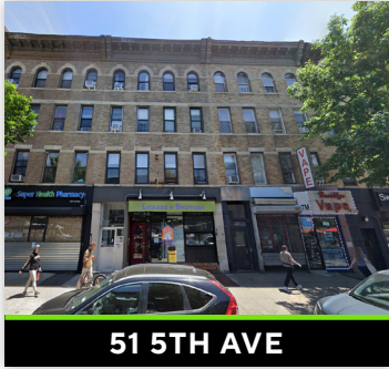
51 5TH AVE