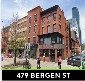
479 BERGEN ST