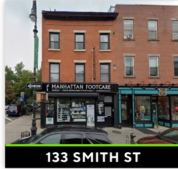
133 SMITH ST