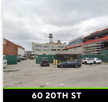
60 20TH ST