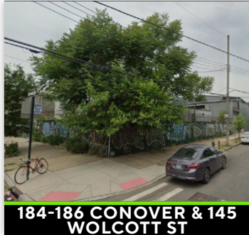
184-186 CONOVER & 145 WOLCOTT ST