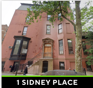
1 SIDNEY PLACE