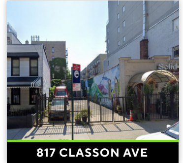
817 CLASSON AVE