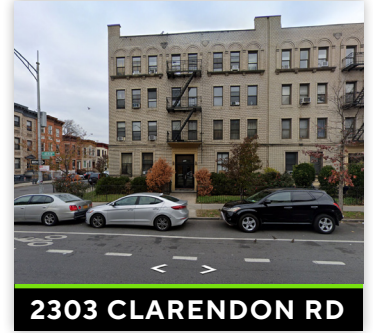
2303 CLARENDON RD