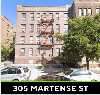
305 MARTENSE ST