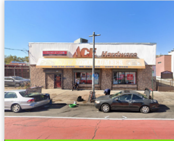
600 UTICA AVE