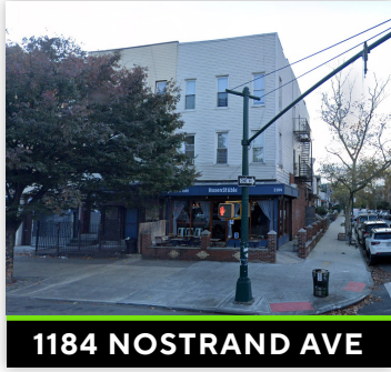
1184 NOSTRAND AVE