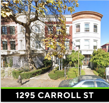
1295 CARROLL ST