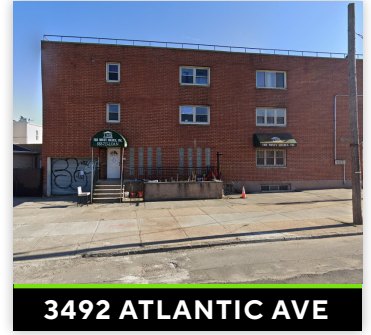
3492 ATLANTIC AVE