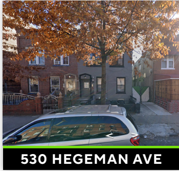
530 HEGEMAN AVE