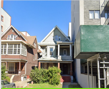
341 LENOX RD