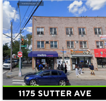
1175 SUTTER AVE