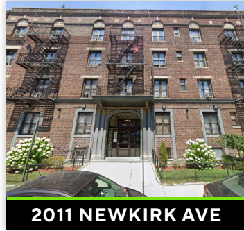
2011 NEWKIRK AVE