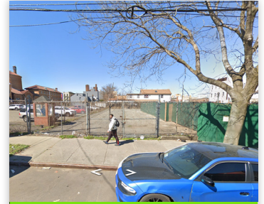
647-651 LIBERTY AVE