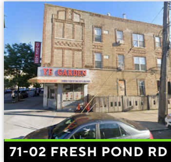
71-02 FRESH POND RD