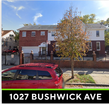
1027 BUSHWICK AVE