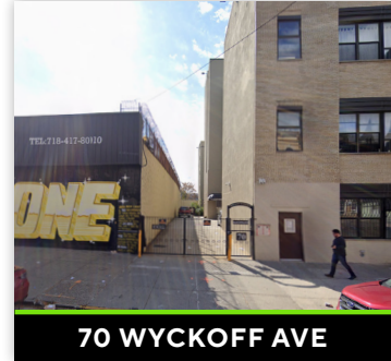
70 WYCKOFF AVE