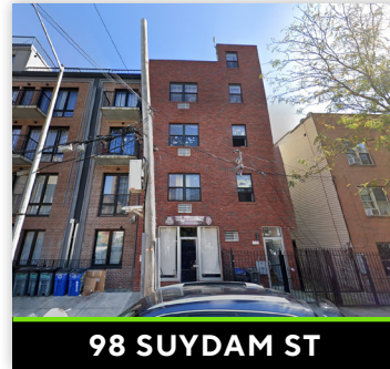
98 SUYDAM ST