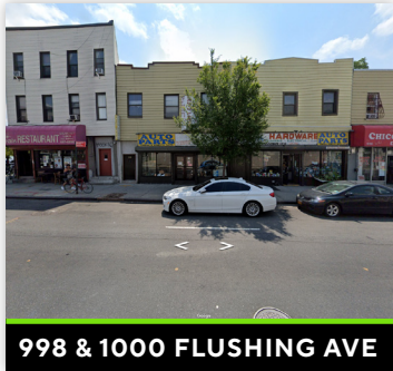
998 & 1000 FLUSHING AVE