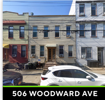
506 WOODWARD AVE