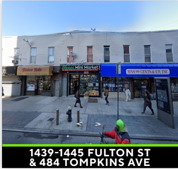
1439-1445 FULTON ST & 484 TOMPKINS AVE