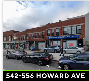
542-556 HOWARD AVE