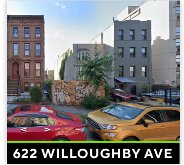
622 WILLOUGHBY AVE