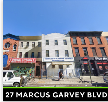
27 MARCUS GARVEY BLVD