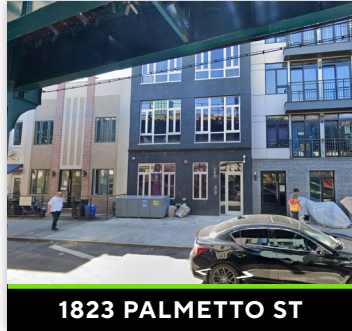
1823 PALMETTO ST