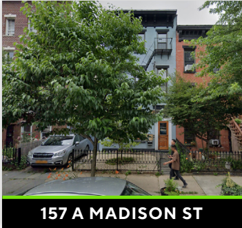
157 A MADISON ST