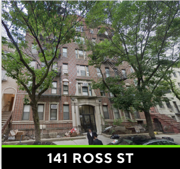
141 ROSS ST