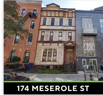
174 MESEROLE ST