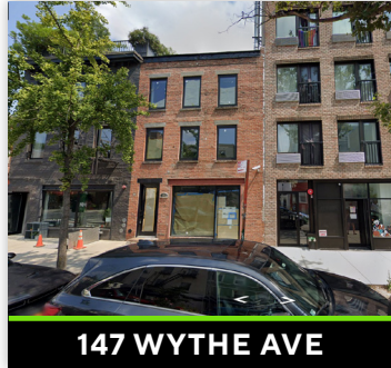
147 WYTHE AVE