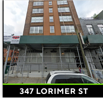
347 LORIMER ST