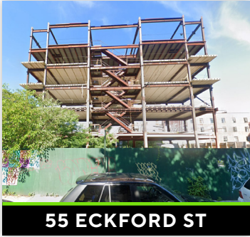
55 ECKFORD ST