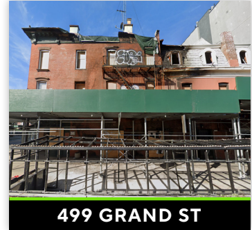
499 GRAND ST