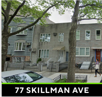
77 SKILLMAN AVE