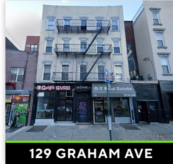
129 GRAHAM AVE