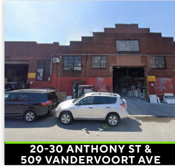
20-30 ANTHONY ST & 509 VANDERVOORT AVE