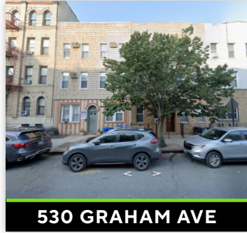
530 GRAHAM AVE