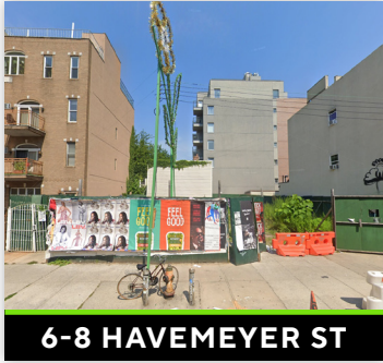
6-8 HAVEMEYER ST