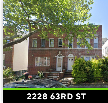
2228 63RD ST