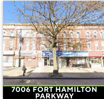
7006 FORT HAMILTON PARKWAY