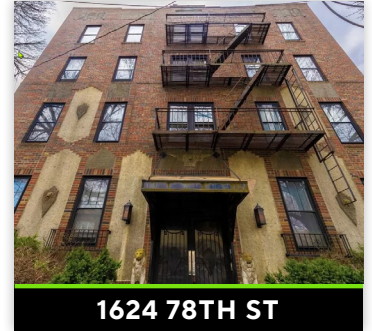
1624 78TH ST