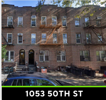
1053 50TH ST