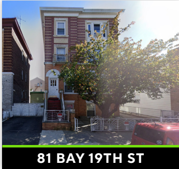
81 BAY 19TH ST