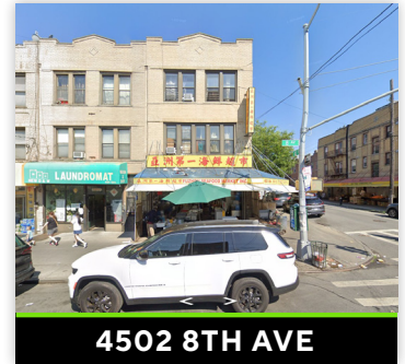
4502 8TH AVE