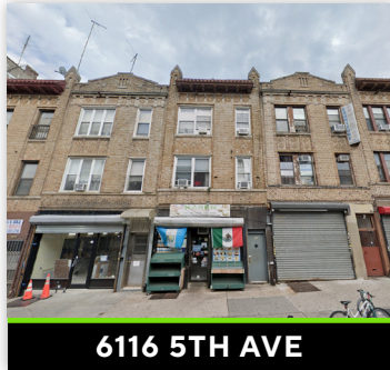
6116 5TH AVE