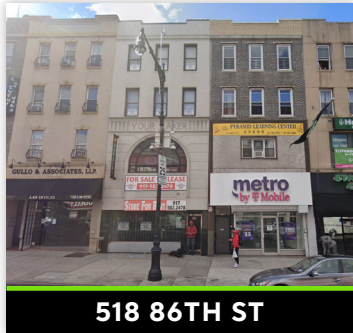
518 86TH ST