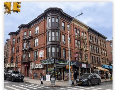
309 7TH AVE