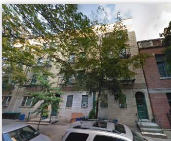
19-21 COLUMBIA PL