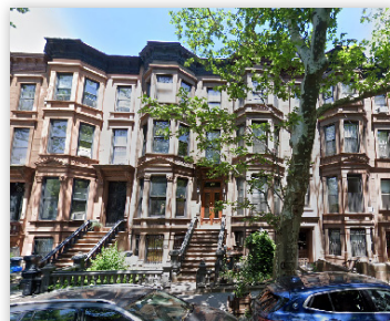
769 CARROLL ST