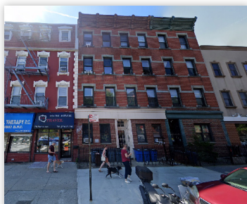
132 NORMAN AV, 196 SACKETT ST & 32 GARNET ST