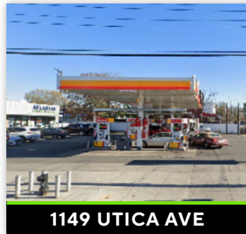
1149 UTICA AVE