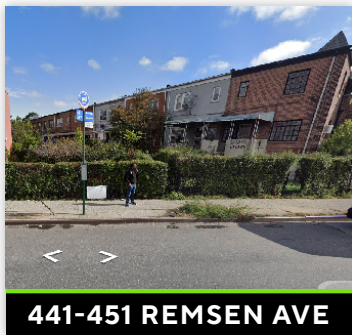
441-451 REMSEN AVE