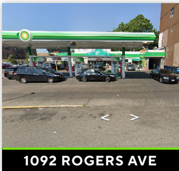
1092 ROGERS AVE