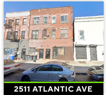
2511 ATLANTIC AVE