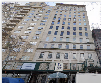
944 5TH AVE