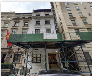
4 EAST 77TH ST