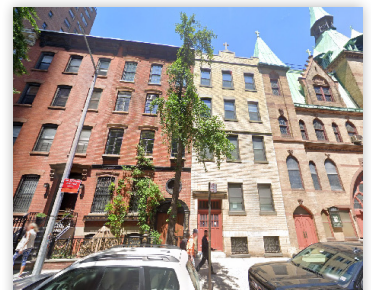
211-215 EAST 83RD ST