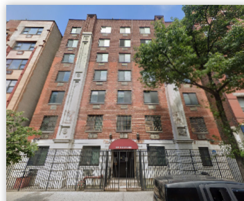
359 WEST 48TH ST