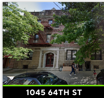
1045 64TH ST