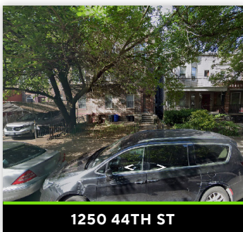
1250 44TH ST