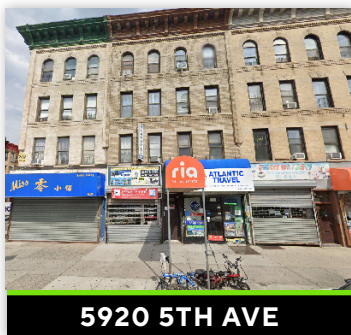
5920 5TH AVE