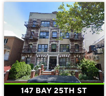
147 BAY 25TH ST