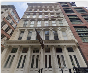
80 WHITE ST