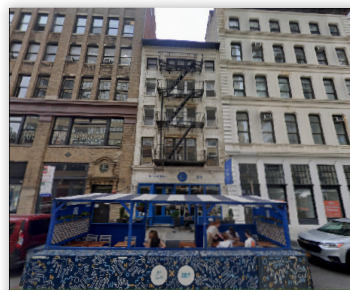
251 CHURCH ST