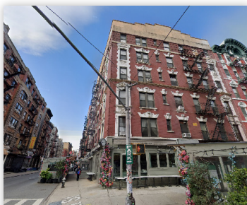
371 BROOME ST