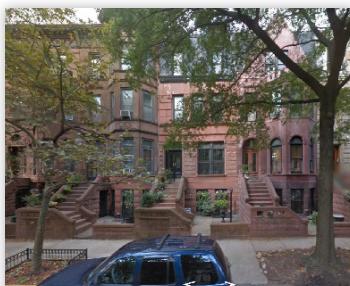
115 BAINBRIDGE ST