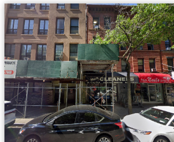
455 DEKALB AVE