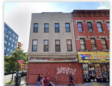
590 BUSHWICK AVE