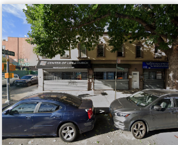
735 MYRTLE AVE