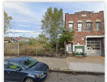
193-199 VARET ST