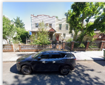
109 DEVOE ST