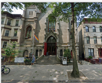
129 RUSSELL ST