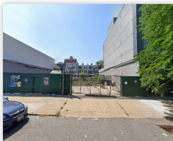
22 FROST ST