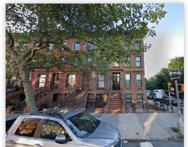
2001 5TH AVE