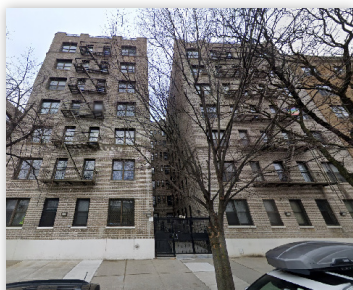
715 RIVERSIDE DRI