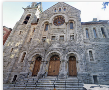
442-444 EAST 119TH ST