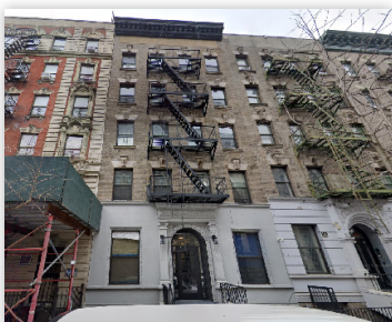
111 & 148 WEST 141ST ST