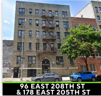
96 EAST 208TH ST & 178 EAST 205TH ST