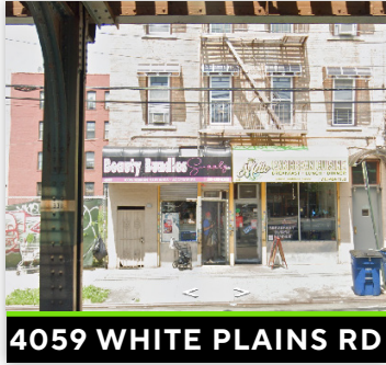
4059 WHITE PLAINS RD