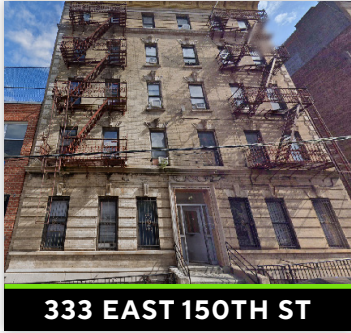
333 EAST 150TH ST