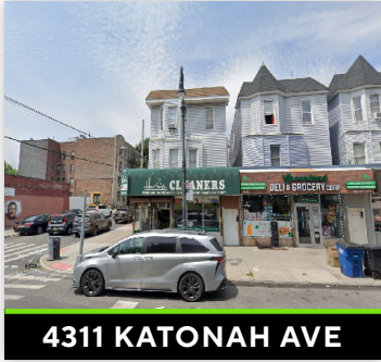
4311 KATONAH AVE