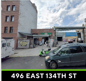
496 EAST 134TH ST