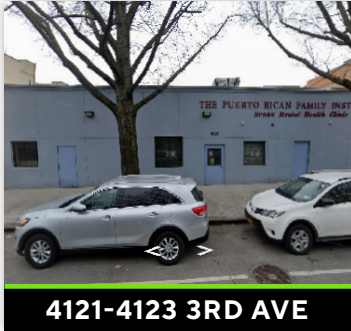
4121-4123 3RD AVE