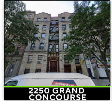
2250 GRAND CONCOURSE