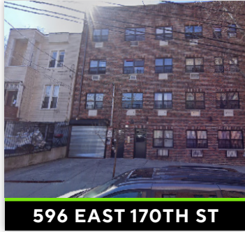
596 EAST 170TH ST