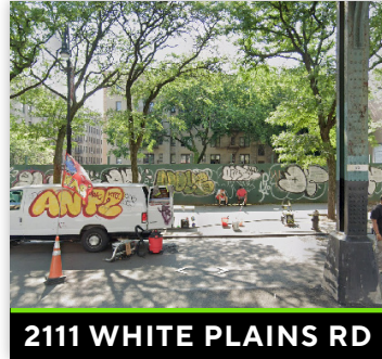
2111 WHITE PLAINS RD