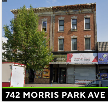
742 MORRIS PARK AVE