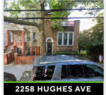
2258 HUGHES AVE