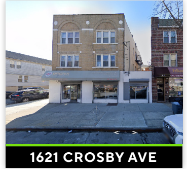
1621 CROSBY AVE