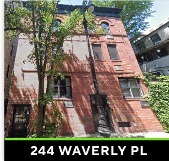
244 WAVERLY PL