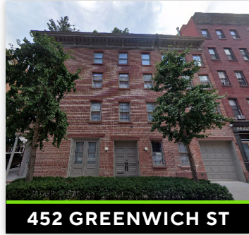
452 GREENWICH ST