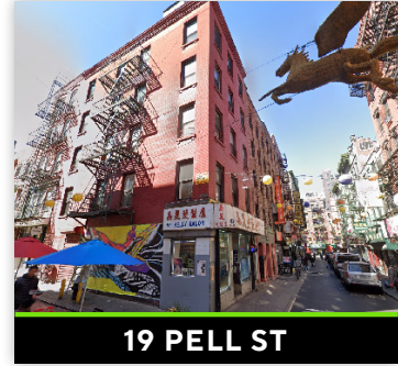
19 PELL ST