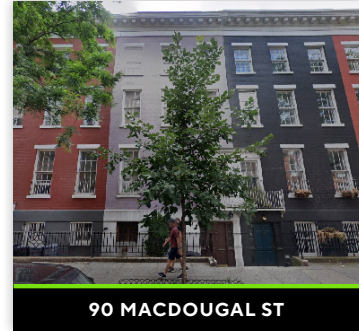
90 MACDOUGAL ST