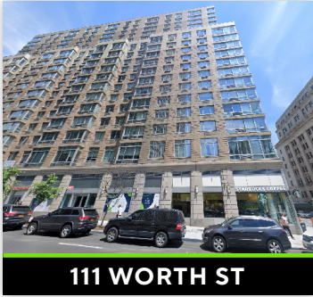
111 WORTH ST