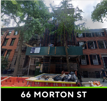
66 MORTON ST