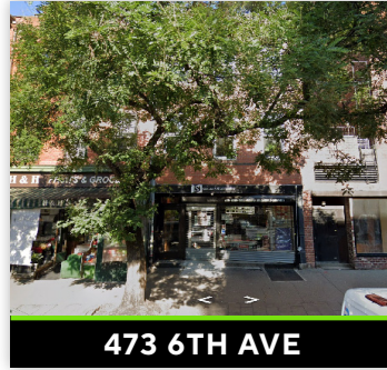
473 6TH AVE