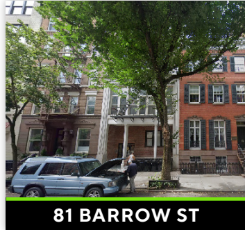
81 BARROW ST