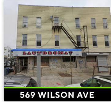
569 WILSON AVE