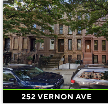
252 VERNON AVE