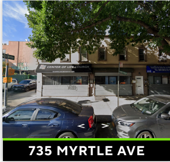
735 MYRTLE AVE