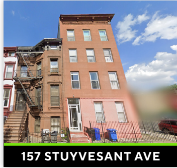
157 STUYVESANT AVE