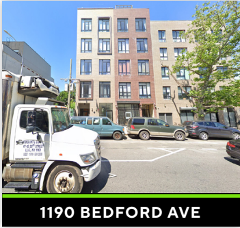
1190 BEDFORD AVE