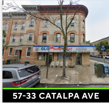
57-33 CATALPA AVE