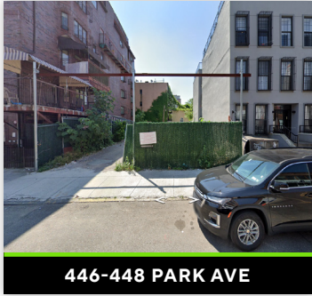
446-448 PARK AVE