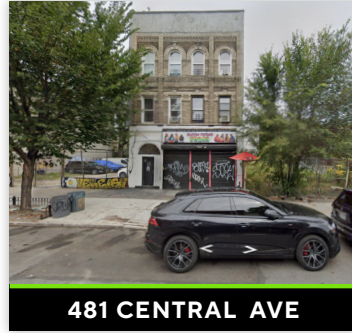
481 CENTRAL AVE