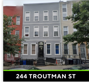
244 TROUTMAN ST