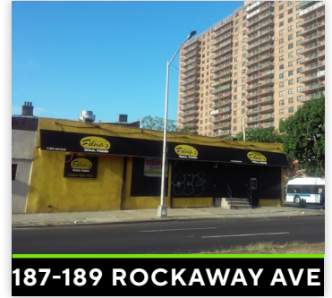
187-189 ROCKAWAY AVE