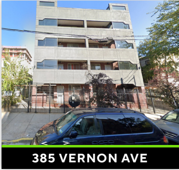
385 VERNON AVE