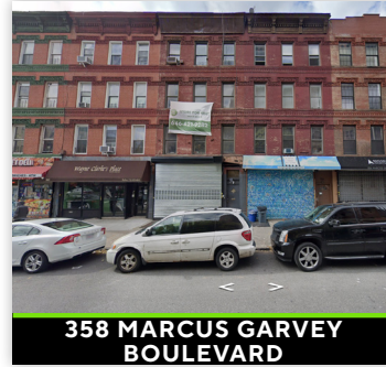
358 MARCUS GARVEY BOULEVARD