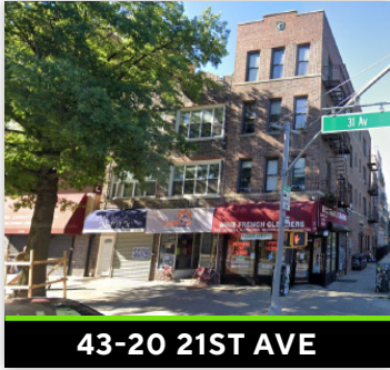
43-20 21ST AVE