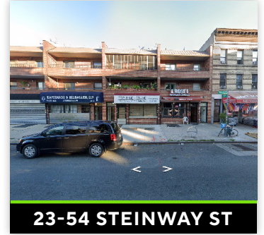
23-54 STEINWAY ST