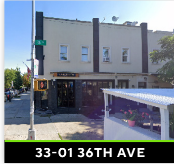
33-01 36TH AVE