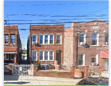
23-12 30TH RD