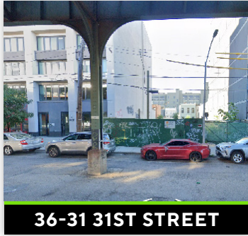
36-31 31ST STREET