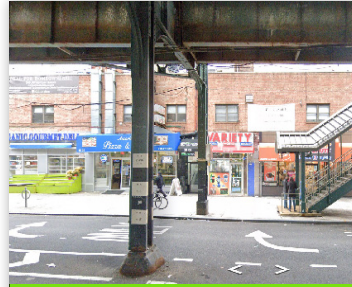
25-02 31ST ST