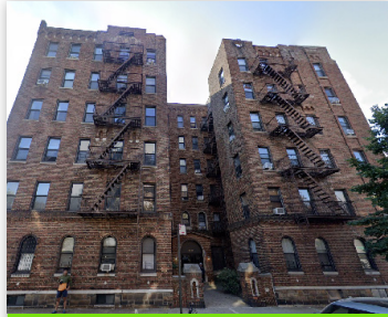
32-85 33RD ST