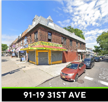
91-19 31ST AVE