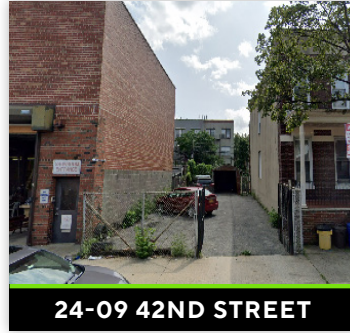
24-09 42ND STREET