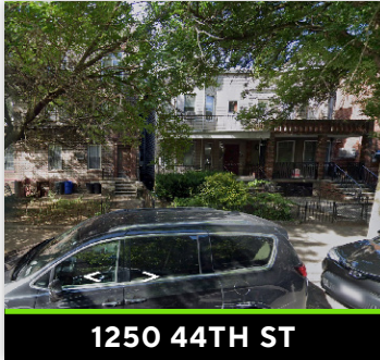
1250 44TH ST