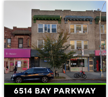
6514 BAY PARKWAY