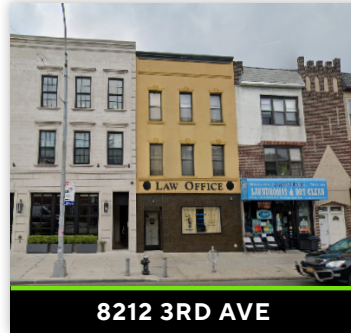
8212 3RD AVE