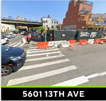
5601 13TH AVE