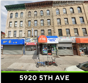
5920 5TH AVE