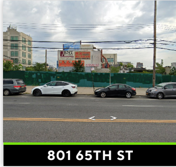
801 65TH ST