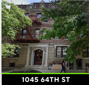
1045 64TH ST