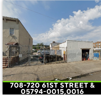
708-720 61ST STREET & 05794-0015,0016