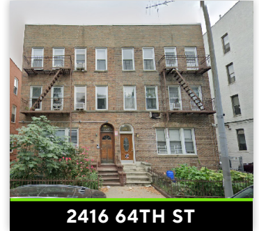
2416 64TH ST