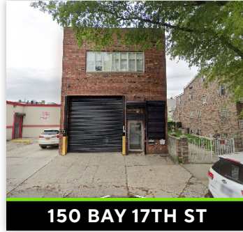
150 BAY 17TH ST