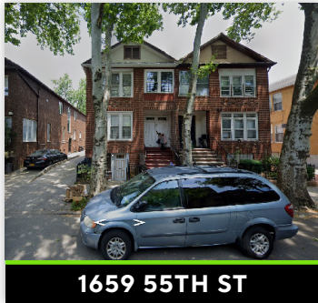
1659 55TH ST