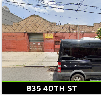
835 40TH ST