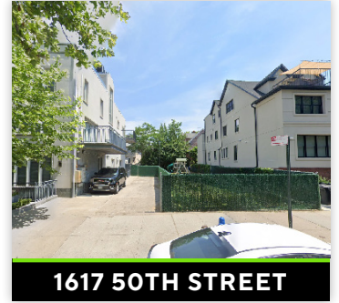
1617 50TH STREET