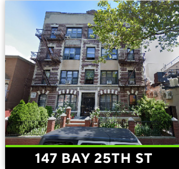
147 BAY 25TH ST