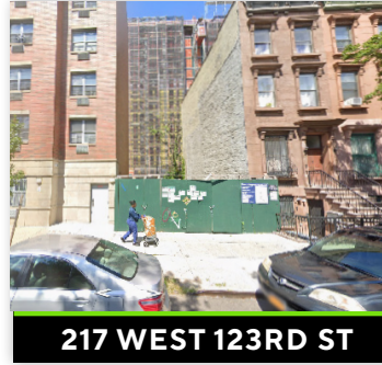
217 WEST 123RD ST