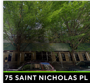
75 SAINT NICHOLAS PL