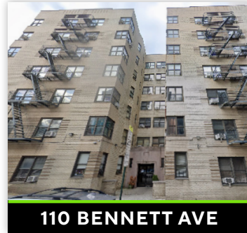
110 BENNETT AVE