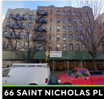
66 SAINT NICHOLAS PL