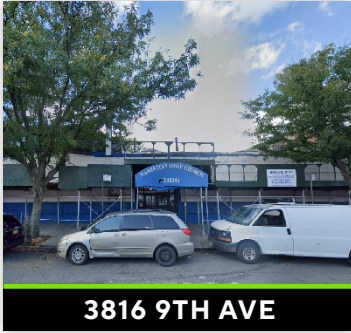
3816 9TH AVE