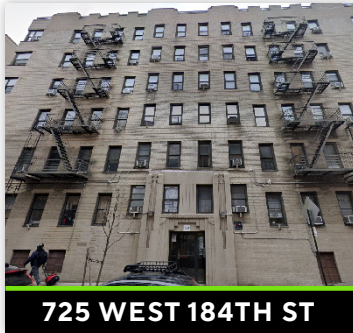
725 WEST 184TH ST