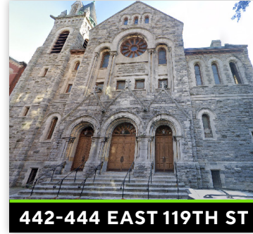
442-444 EAST 119TH ST